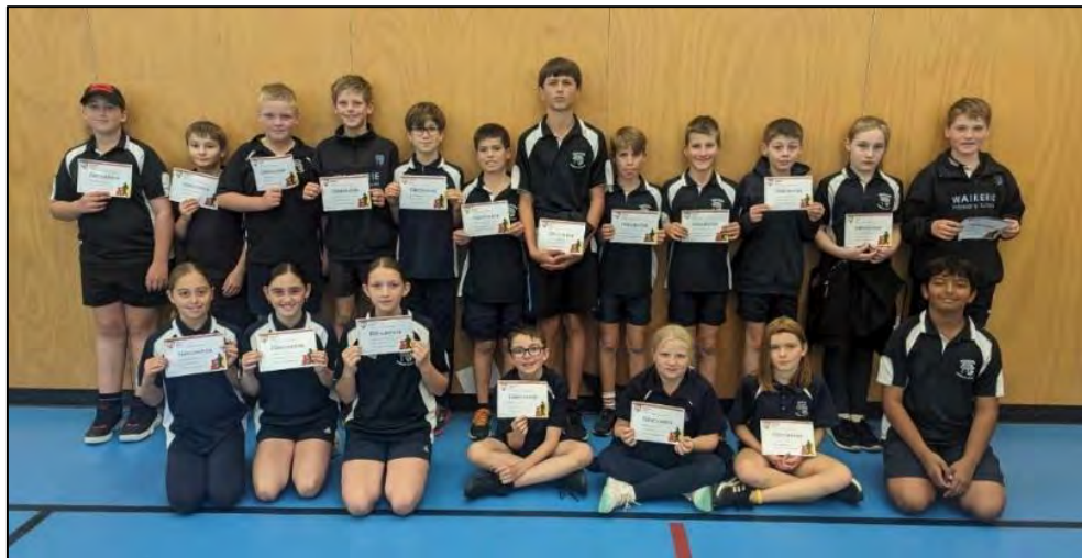
SAPSASA Hockey Team

With only one point between first and second at last week's assembly, it's definitely going to be a close race to see who will take out this term's win.