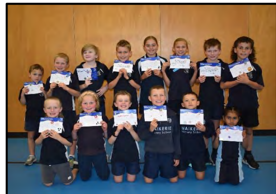
SAPSASA Netball Team