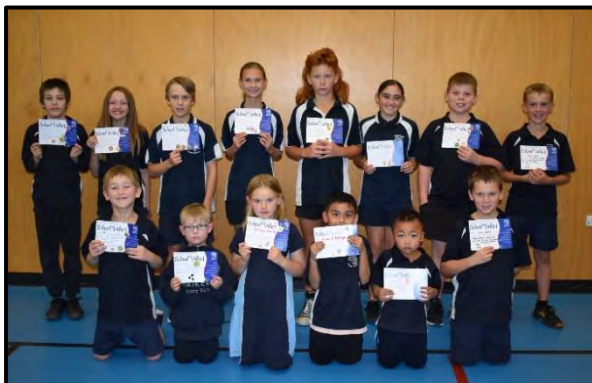
SAPSASA Athletics Team