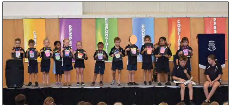
Room 10 - We are Bucket Fillers

The term is certainly flying by and school has continued to be a hive of activity! We enjoyed our assembly last week where we announced our Student Voice representatives and Youth Environment Team, and presented Visible Learner, Values and SAPSASA awards. We also enjoyed a 'spotlight on learning' with Room 10 Reception students who shared with us about bucket filling ☺