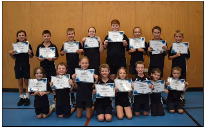
2024 Student Voice Representatives

We are looking forward to seeing families at our Family Night on Monday March 25 th . This will be an opportunity for parents to visit classrooms and talk to teachers. We will have a sausage sizzle for staff and school families. We hope to see you there!