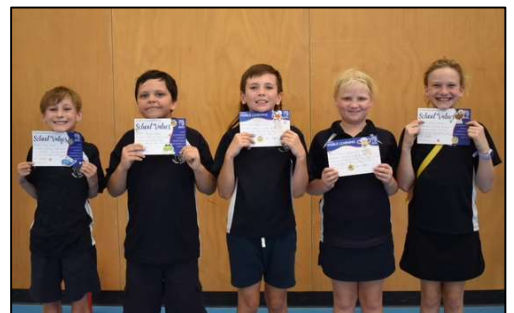
Visible Learner and Values Awards