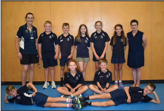
2024 Youth Environment Team