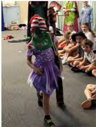
Fashion Parade and Lunch at the Hotel